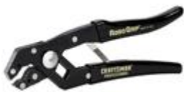
Craftsman ® Professional Robo-Grip ® Pliers

To avoid repetitive motions and strain injuries associated with using a hand tool over a prolonged period of time, use ratcheting tools or adjustable tools with spring-loaded returns. It is also important to keep your hand tools properly maintained and sharpened to reduce grip force and repetition. Many people do not think about this, but if a saw blade is dull, it will take much longer to cut through a piece of wood than it would if the blade were sharp.