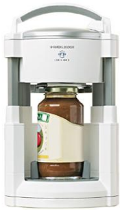
Lids-Off Automatic Jar Opener by Black & Decker

The first device is the Lamp Commander™ by Salton . The device allows the user to control a lamp via speech recognition. It is available at Lowe's® for about $39.96, and it really works. Unlike other systems that use speech recognition for device control, the Lamp Commander does not require the user to do any voice training prior to using it. Just take it out of the package, plug it into the wall, plug a lamp into it, and it is ready to use. The Lamp Commander can control up to two lamps using the same unit. Now, this does not mean each lamp can be independently controlled, but if there are two lamps that need to be turned on at the same time, this device will do that. I have been able to find this product online for around $19.95.