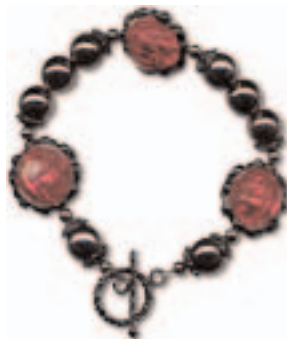
Cellular jewelry by Potomac Technology