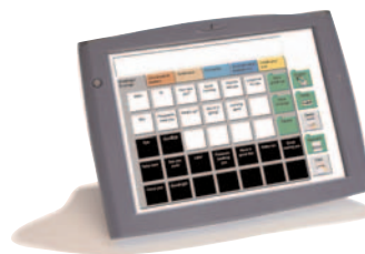
DV4 by DynaVox