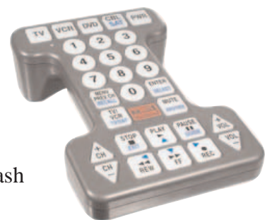
Oversized Universal Remote Control by TK Partner

Oversized Universal Remote Control – TK Partner