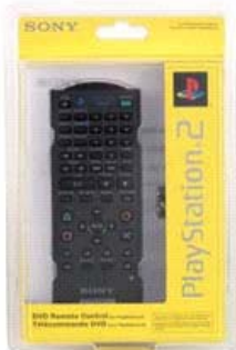
PlayStation 2 controller

My next bargain is actually a tip I received from an AAC discussion group, and it's pretty neat! If you are an individual who uses an AAC device with an infrared (IR) output so that you can control a television remote or any other IR environmental control unit, you can now access your Playstation 2 or Xbox for between $20 and $40. Both of these game systems have various DVD playback sets you can purchase (they range in price). This is the key to being able to control the system because included in the sets are IR receivers. Also included are remote controls that include the regular buttons on the gaming controller. So all you have to do is the standard IR remote training you would do for any other remote control and set up an appropriate interface screen for the user, and then you're all set to play your favorite games! This will not provide access to the L3 and R3 buttons on the PS2 controller, but it will get you there with everything else. You also have the added benefit of being able to control the DVD playback of the systems. So no more sitting on the sidelines when everyone else is playing. Time to get in the game!