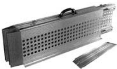
Suitcase ramp (shown folded)

The new Windows Vista operating system has several new accessibility features built into it. Check the Microsoft website, www.microsoft.com/enable/products/windowsvista , for more detailed information.