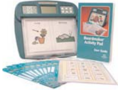
Boardmaker Activity Pad