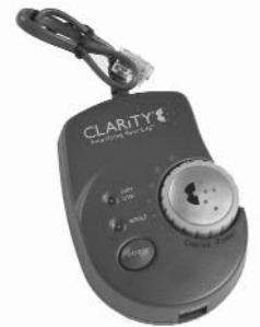
Portable Phone Amplifier