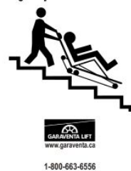
Emergency Evacuation Device

Whether at work or at home, people who use a wheelchair face significant issues related to emergency planning. If you're a wheelchair user and live or work above the first floor, your emergency plans should take into consideration the possible absence of an elevator or lift. There are several devices that can assist in such an evacuation. One option is the Evacu-trac emergency evacuation chair by Garaventa . This chair is designed for use by one person to transport a wheelchair user down stairs without additional help. Information about the chair is available on their website ( www.garaventa.ca/et/ ) or by calling 866-824-8314.