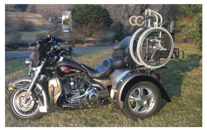
Here is a wheelchair lift on a custom trike. The wheelchair is attached to an arm on a track that lifts it onto the fender. The lift gives riders wheels on their bike or in their chair and is the product of The Freedom Track, www.freedom-track.com.

Where is the Haus of Trikes located? The shop address is 36350 Dupont Boulevard (Route 113), Selbyville, Delaware 19975. Contact Jeff at 410-251-2146, info@hausoftrikes.com, or visit the website at www.hausoftrikes.com. ■