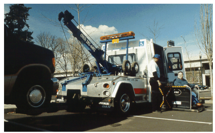
Emergency roadside assistance for you, your vehicle, and your mobility device, 24 hours a day, 7 days a week, 365 days a year.

As a Delaware resident, you are invited to take advantage of this service and receive a 14-month membership for the price of a 12-month membership. Call 1-800-720-3132 for more information or go online at www.regonline.com/delaware. You are invited to visit http://americandriversalliance.com or call the number listed above to learn more about ADA Nationwide .