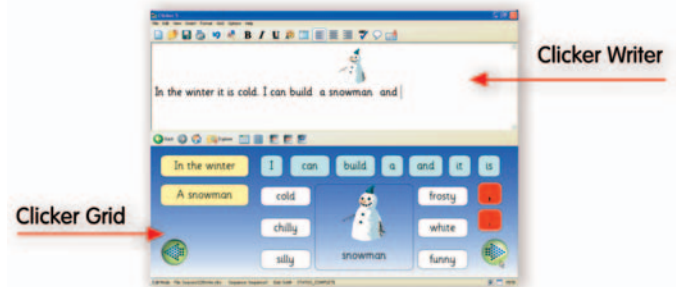
Screen shot from Clicker by Crick Software

Using the Clicker program, teachers can create customized on-screen keyboard grids with letters, words, phrases, or pictures. Students can then use these word banks to assist in their writing. When they click on a word or picture in the grid, the word