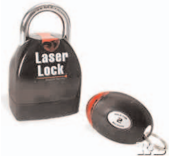
Laser Lock by Kidpower Inc.

a remote instead of a key or combination. This is a great little gadget for students who have difficulty remembering a combination or using key or combination locks. This is a nice little gizmo for the school locker.