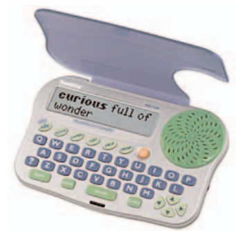
Speaking Interactive Children's Dictionary by Franklin