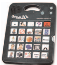
GoTalk 20+ by Attainment