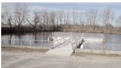
Ted Harvey Wildlife Area

least one outdoor option to consider. The parks I visited in Kent and New Castle Counties did not have accessible trails. If you would like to experi-