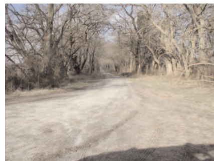
Ted Harvey Wildlife Area

Known as Buckmasters American Deer Foundation (BADF), a Dis-