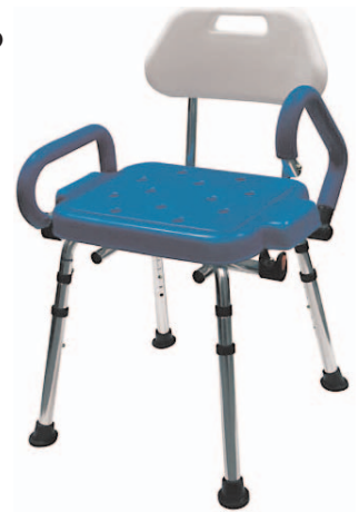
Not to be outdone, Target ® LifeCare shower chair with swing away arms

Remember, it is only available from Wal-Mart online at www.walmart.com .