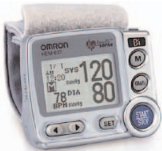
Omron Automatic Wrist Blood Pressure Monitor with APS

Switching gears a bit, I recently found a steal of a deal at Wal-Mart ®. The Omron Automatic Wrist Blood Pressure Monitor with APS is a great blood pressure monitor with a large, easy-to-read display available for only $74.88. Now for those of