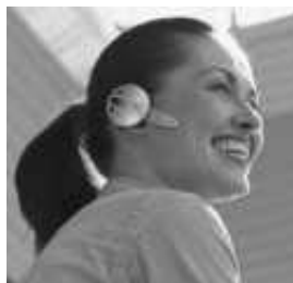
GN ReSound's specialized Bluetooth headset and how it's worn

This new headset would fit over the ear with the hearing aid in place with virtually no risk of interference. This new headset weighs 28 grams and is compatible with some GN ReSound and Beltone hearing aids.