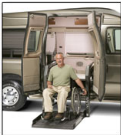
Vista Series Lift (Braun Corp., contact Braun dealer for price)

Driver seats can be converted and adapted to meet an individual's specific needs. Lifts and ramps may also be added to a vehicle to enable an individual who uses a wheelchair or scooter to easily enter and leave a vehicle. Some vehicles can be modified so the individual can drive the car while sitting in his/her mobility device. Vendors for the products mentioned above include Bruno Independent Living Aids ( www.bruno.com , 800-882-8183) and Independent Mobility Systems ( www.ims-vans.com , 800-IMS-VANS).