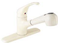
American Standard Reliant Bone Single Handle Pull-Out Kitchen Faucet (Home Depot, $99)

The next bargain recommendation is actually about two stores from which to purchase AT devices— Home Depot and Lowes . Both stores have lots of assistive technology that is useful around the house. Let's start with the kitchen sink. Sometimes it can be difficult to reach the faucet, especially if an individual uses a wheelchair and does not have a sink that the wheelchair can roll under. A pull-out faucet helps address this problem.