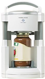
Lids-Off Automatic Jar Opener by Black & Decker

The first device is the Lamp Commander™ by Salton . The device allows the user to control a lamp via speech recognition. It is available at Lowe's® for about $39.96, and it really works. Unlike other systems that use speech recognition for device control, the Lamp Commander does not require the user to do any voice training prior to using it. Just take it out of the package, plug it into the wall, plug a lamp into it, and it is ready to use. The Lamp Commander can control up to two lamps using the same unit. Now, this does not mean each lamp can be independently controlled, but if there are two lamps that need to be turned on at the same time, this device will do that. I have been able to find this product online for around $19.95.