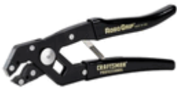
Craftsman® Professional Robo-Grip® Pliers

To avoid repetitive motions and strain injuries associated with using a hand tool over a prolonged period of time, use ratcheting tools or adjustable tools with spring-loaded returns. It is also important to keep your hand tools properly maintained and sharpened to reduce grip force and repetition. Many people do not think about this, but if a saw blade is dull, it will take much longer to cut through a piece of wood than it would if the blade were sharp.