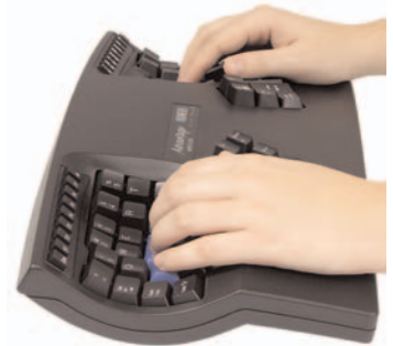
Kinesis Advantage USB keyboard features a contoured shape.

But use of a keyboard and mouse can cause even more discomfort in people with arthritis. Consider using an ergonomically designed keyboard and mouse—devices that are designed to accommodate your hands, instead of your hands accommodating the devices. There are many different options available.