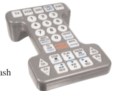
Oversized Universal Remote Control by TK Partner

Oversized Universal Remote Control – TK Partner