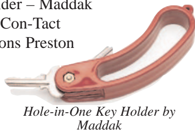
Hole-in-One Key Holder by Maddak

2 Handle Clear Cup w/2 Lids – Providence Spill-proof Container T-Shaped Rocker Knife – Sammons Preston Rolyan Kings Lightweight Foam Utensil Handle – Ability One Homecraft Plastic Handle Bent Utensils – Sammons Preston Rolyan Flexible Utensils – Richardson Products Lighted Magnifying Toenail Clipper – Prime Way Companies Home Travel Pillbox Timer – LifeWise Talking Thermometer – Independent Living Aids Ezy Dose Meditime Planner – Apothecary Products Ezy Dose Magnifying Pill Cutter – Apothecary Products Medication Weekly Manager – Timex Medication Daily Manager – Timex Carpal Tunnel Wrist Supports – Bruce Medical Grocery Grip – Elder Corner The Grip-All – Ableware Doorknob Grips – Great Grips D-Grip add on Handle – Motus T-Grip add on Handle – Motus EZ Pour Holder for Containers – Independent Living Aids EZ Flo Auto Faucet Control – International Environment Grip-It Multipurpose Tool – Grip-It Products Jug Tipper – Ability One Homecraft Universal Holder – Sammons Preston Rolyan Weighted Universal Holder – Kinsman Enterprises Hole-in-One Key Holder – Maddak Non-Slip Grip Mat – Con-Tact 26" Reacher – Sammons Preston Rolyan Angled Measuring Cup – World Kitchen One-Handed Cordless Can Opener – Black & Decker 4-Way Multipurpose Can Bottle Opener – Evriholder Product Jar Vise – SCI Cuisine International Folding Pot Stabilizer – Parsons A.D.L EZ Flip Spatula Big Number Measuring Cups – Bradshaw International