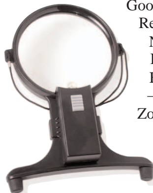
Hands Free Magnifier by Carson Optical

Retractable Pocket Magnifier – Ultra-Optix