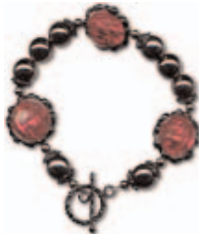
Cellular jewelry by Potomac Technology