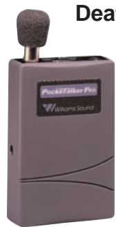
PockeTalker Pro by Williams Sound

Hearing Helper System 350E – Williams Sound