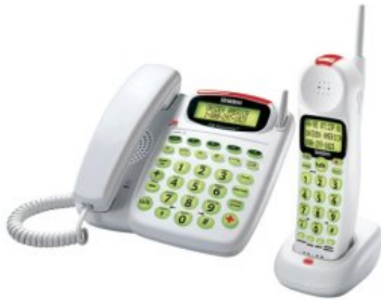
Uniden 5.8 GHz Analog Desktop Handset Combo with Digital Answering System

hope we all have fun here and learn about some things we may not have known were out there. Now, with that little bit of business behind us, let's get to the bargains!