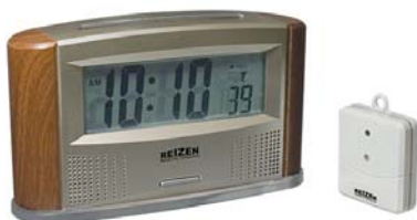
Radio Controlled Talking Clock by Reizen