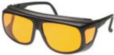
SunShields by UVShield

Check and Deposit Register – Independent Living Aids SunShields (multiple colors and absorption percentages) – UVShield