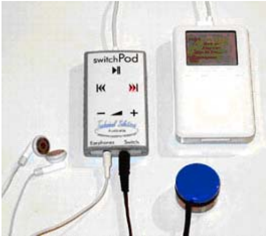
switchPod by Technical Solutions Australia

Technical Solutions Australia (TSA) has designed the switchPod to allow switch users to control some functions of Apple's iPod using the iPod's remote control socket. The switchPod is compatible with the iPod , iPod mini , and iPod photo . TSA is currently working on a version for the iPod nano .