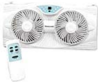
Honeywell Twin Window Fan with Remote Control

My third bargain is a cool item that would make a great gift. The Sportline 353 Talking Pedometer is a nifty little gadget. The name tells you just what it is—a talking pedometer. It also has a radio so you can listen to your favorite radio station while you're walking. The pedometer will tell you number of steps, distance walked, and estimated calories burned. There is even a volume control on the headset so you don't have to mess with the unit itself to turn the volume up or down. You can find it at Wal-Mart for around $30.