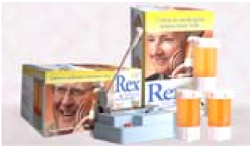
Rex the Talking Prescription Bottle Base by MedivoxRx

Royal Tel-Weight Digital Talking Bathroom Scale – Reizen Talking Blood Pressure Monitor – Reizen Illuminated Hand Held Magnifiers (multiple strengths) – Eschendbach Optik of America Hand Held Halogen Magnifier Handle and Lenses – Eschendbach Optik of America LED Magnifier Handle and Lenses – Eschendbach Optik of America 13 Watt Portable Magnifier Task Lamp – OTT-LITE 13 Watt Reading Lamp – OTT-LITE 18 Watt Floor Lamp – OTT-LITE Rex the Talking Prescription Bottle Base – MedivoxRx