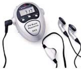
Sportline 353 Talking Pedometer

My third bargain is a cool item that would make a great gift. The Sportline 353 Talking Pedometer is a nifty little gadget. The name tells you just what it is—a talking pedometer. It also has a radio so you can listen to your favorite radio station while you're walking. The pedometer will tell you number of steps, distance walked, and estimated calories burned. There is even a volume control on the headset so you don't have to mess with the unit itself to turn the volume up or down. You can find it at Wal-Mart for around $30.