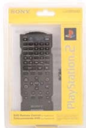
PlayStation 2 controller

My next bargain is actually a tip I received from an AAC discussion group, and it's pretty neat! If you are an individual who uses an AAC device with an infrared (IR) output so that you can control a